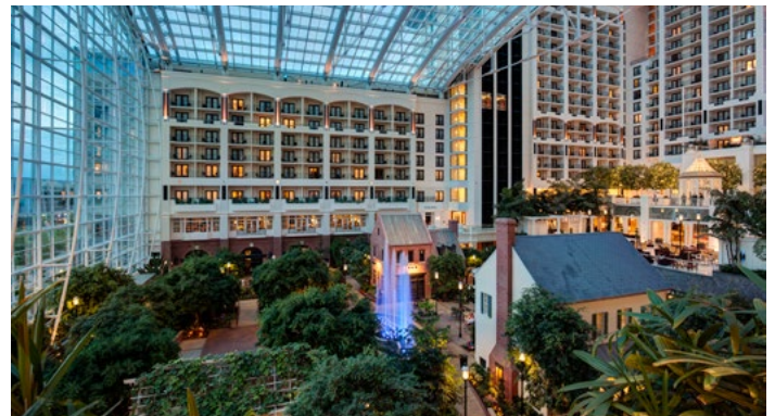
Gaylord National Atrium

Make reservations online at www.acsm.org/atpc or calling Marriott Reservations at (800) 228-9290 or 301-965-4000 and mention the Advanced Team Physician Course to receive the discounted rate. Reservations must be made by November 7, 2017 and are available on a first-come, first-serve basis. The ATPC discounted hotel room rate is $203 ($181 room + $22 resort fee). ACSM's preferred travel agency, ALTOUR, can assist you with travel plans. Call 800-428-6186 to speak with an agent.