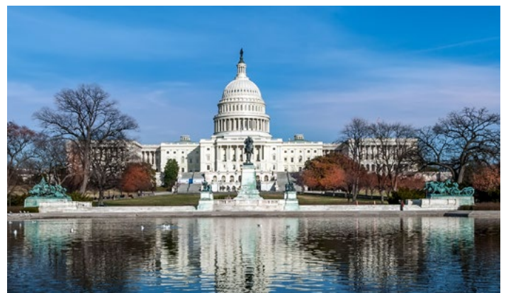
The Gaylord National Resort & Convention Center is located just minutes from downtown Washington, D.C.